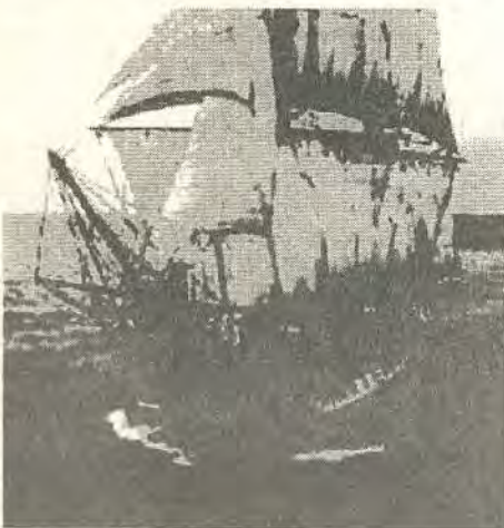
The square-rigger Hope