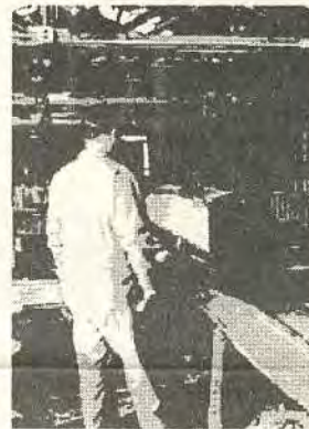
Peeling off a board